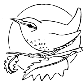
Stawley Primary School