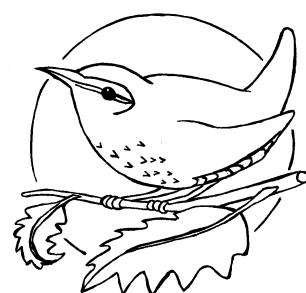
Stawley Primary School